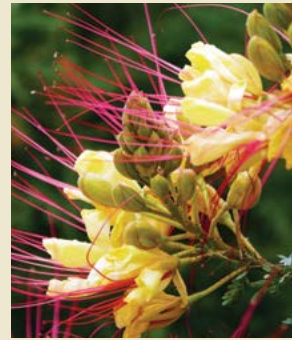
Yellow Bird of Paradise