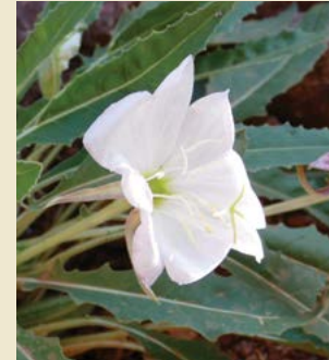
White Evening Primrose