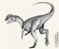
Dilophosaurus 20' long • 1,000 lbs