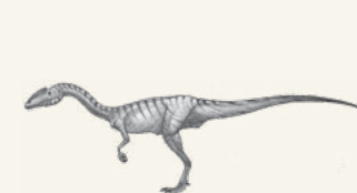
Megapnosaurus 10' long • 65-85 lbs

Red Hills Desert Garden features a variety of unique fossil tracks made by dinosaurs of all sizes as they walked in the mud or swam in shallow streams that existed here approximately 200 million years ago. Tracks for megapnosaurus scutellosaurus and dilophosaurus are located throughout the garden.