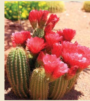
Argentine Giant Cactus